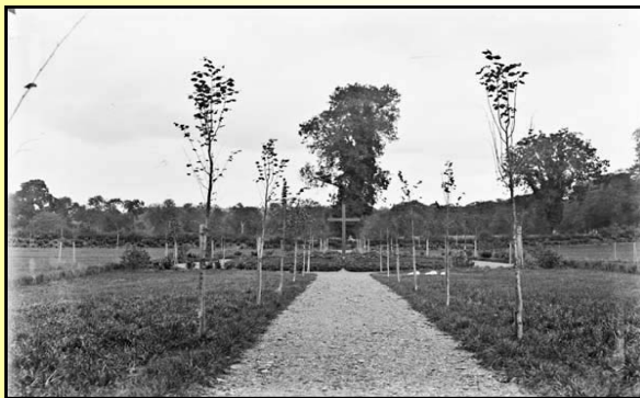
Kells Cemetery photo from Navan Road c. 1909

We welcome all visitors to the Ceremonies, especially all who have travelled from abroad.