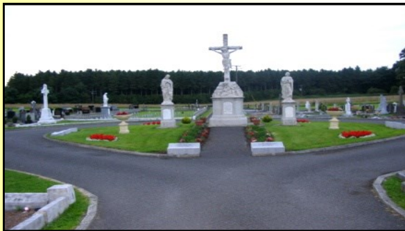
St. Colmcille's Cemetery 2018