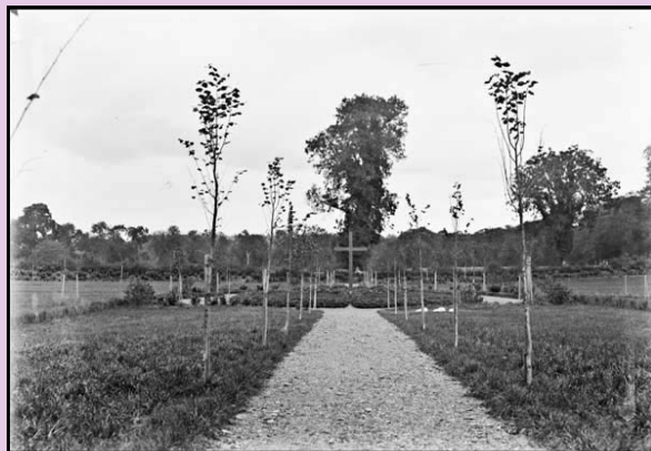
Kells Cemetery photo from Navan Road c. 1909