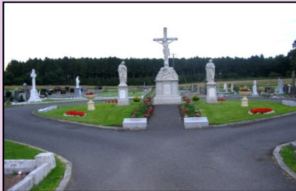
St. Colmcille's Cemetery 2017

St. Vincent de Paul Helpline: 087 2934507 - Shop Donations/Enquiries: 0862556750