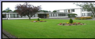
Girls' Primary School Reopens: 29/8/2018

We pray that the Holy Spirit may guide and inspire the children, teachers, staff and parents through the academic year of 2018/19. We wish well in particular to all Junior Infants, First Years in Post Primary School and those beginning College.