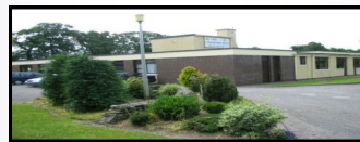
Boys' Primary School Reopens: 29/8/2018