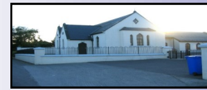
Drumbaragh School Reopens: 30/8/2018