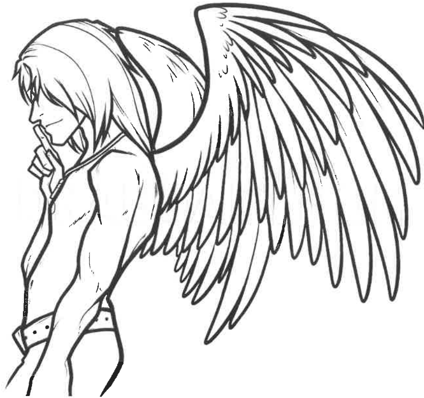
ST MATTHEW (THE WINGED MAN)